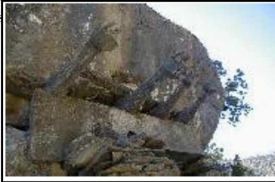
Photograph 2 - The Statue Carved for the Dead Ancestor at Gandao

Muslims of the region are not very keen on visual arts. They do not take interest and create any sculptures. Their main interest is in the traditional Islamic calligraphy. The Kalash believe that there are certain gods and goddesses who facilitate the supreme god dezau as invisible creatures, but don't delegate any specific shapes and structure to them. This very ideology helps them to be distinguished from Hinduism. As the history entails that they have been severely treated and persecuted by the Hindu Rajas and Mahrattas. The people are fond of making wooden effigies, as an image of their ancestors, at Gandao to honor the memory of his father "dada". This is done in November on sariiek festival. In year 2008 this festival was celebrated at the mega level as a revival of long forgotten tradition. The woodcutter and the carpenter go to the woods and find a suitable tree with fine nodes is called upon by the deceased name. They chop down to carve the face and cut the trunk, according to the man's size they further carry it to the cemetery. The carpenter, by employing his artistic capabilities shapes the forehead, nose, and lips of the dead man. For making the eyes, they fill the hollow spaces with pebbles